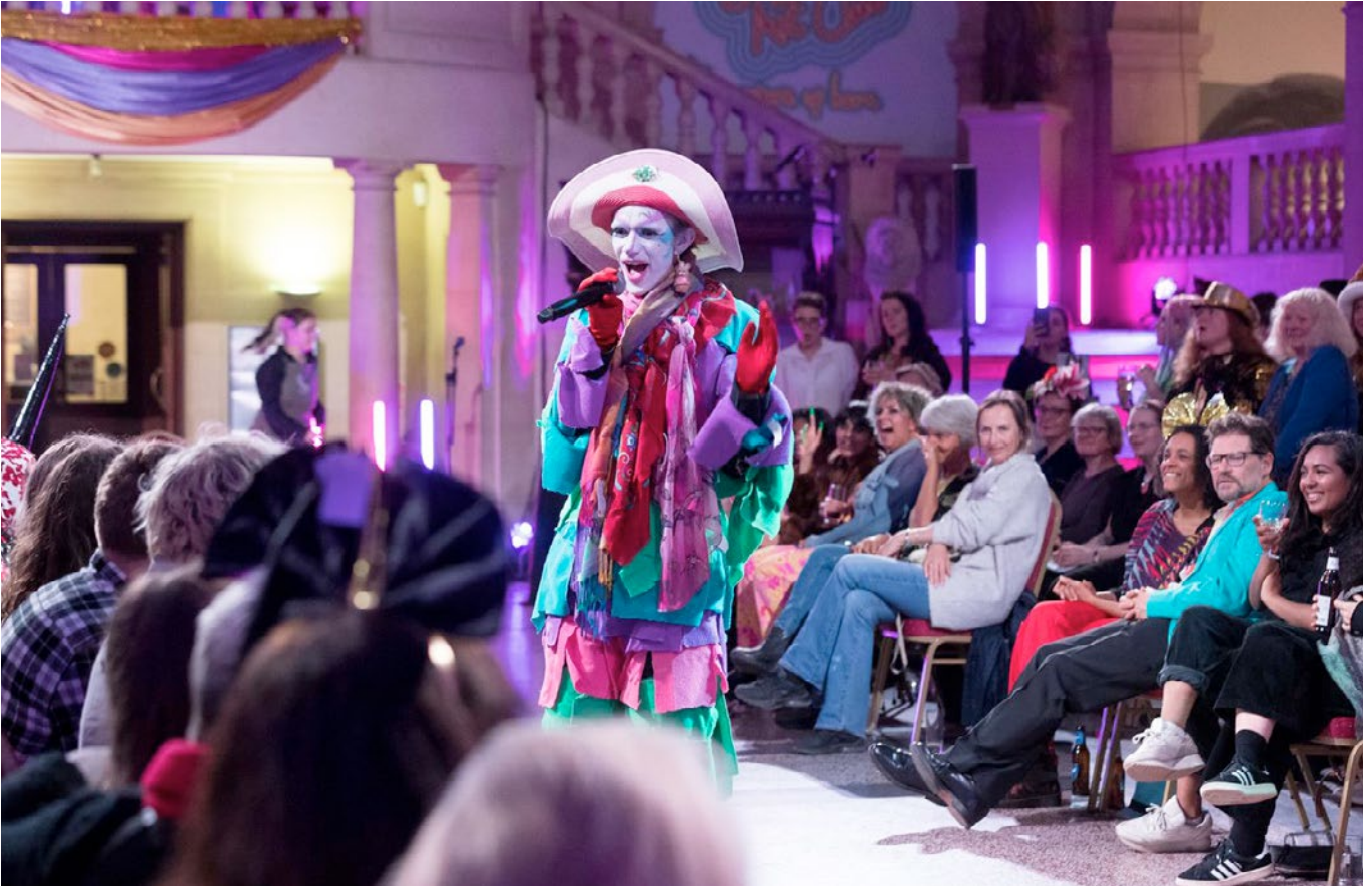
Museums at Night events welcome vibrant performances and diverse audiences