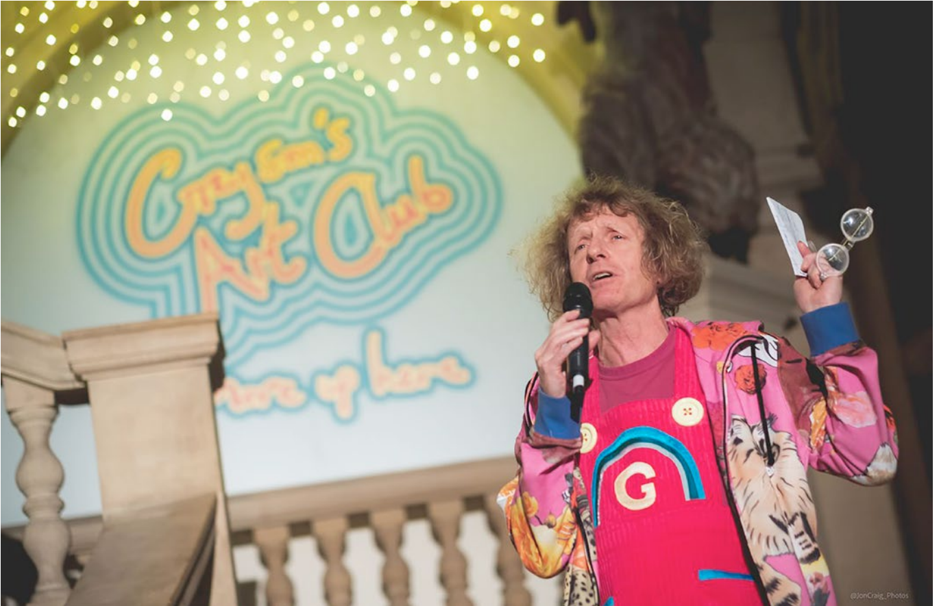
Corporate Members have access to Private View events before the launch of new exhibitions, with brilliant guest speakers.