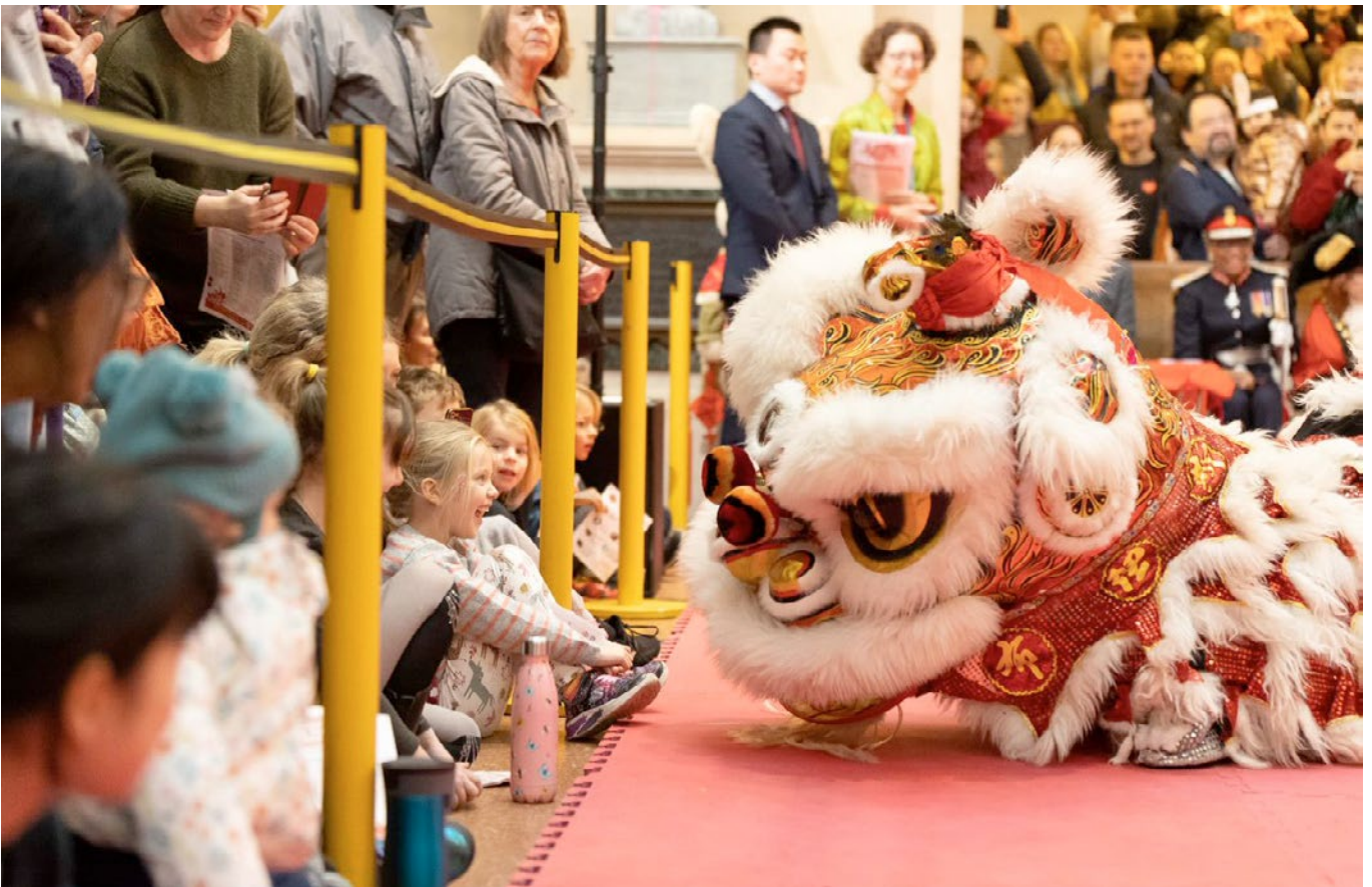
Our Lunar New Year celebrations delight thousands of families every year