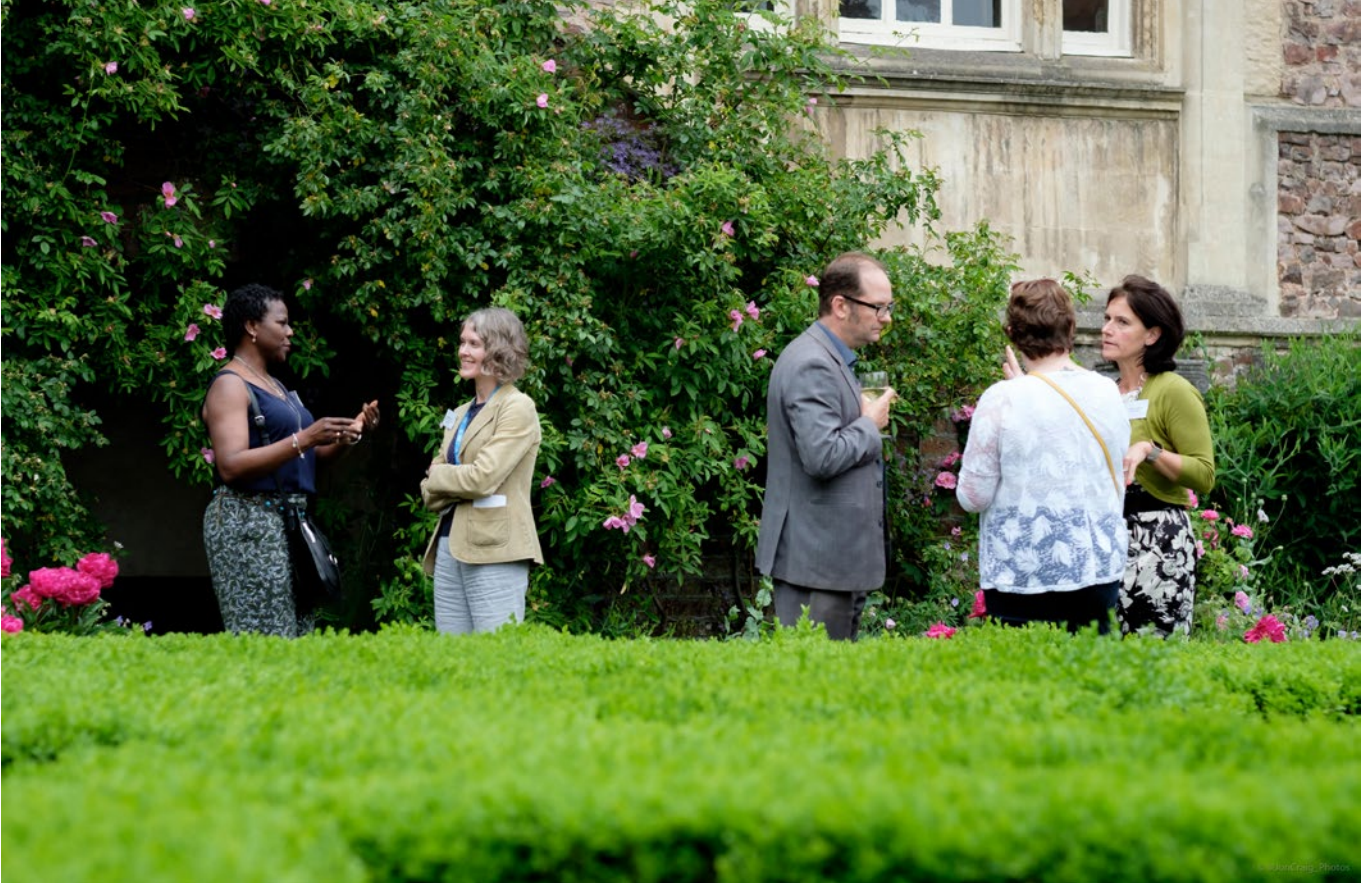
Corporate Members are invited to Bristol Museums Development Trust's annual summer party at one of our seven venues.